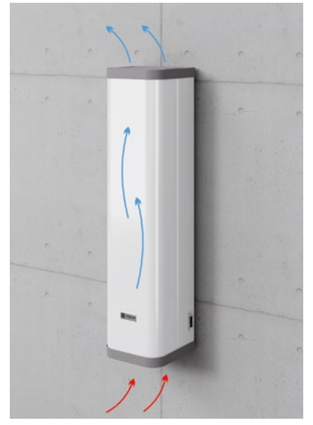
Airflow disinfection function

In ECO mode, the adjustable fan allows the airflow to be reduced to 110 \text{ m}^3/\text{h} , which makes the luminaire's operation quieter. Please note that in order to obtain a sufficiently high level of disinfection efficiency in this mode, the luminaire must operate at least two hours longer than in the standard mode