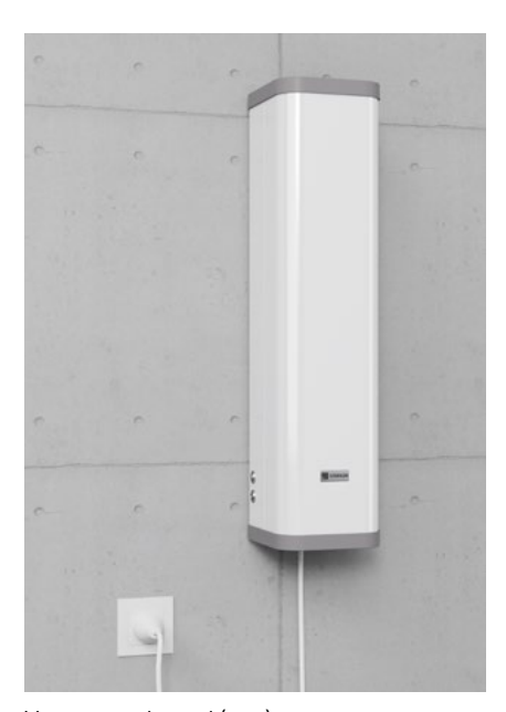
Version with cord (3 m)